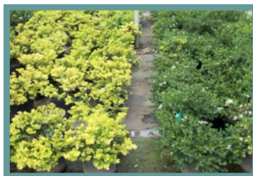
Unfertilized vs. Fertilized

We recommend a 12.6.6 MARCH / JUNE/ SEPTEMBER